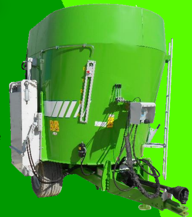
VC-14 Pictured with optional conveyor and controls by cable