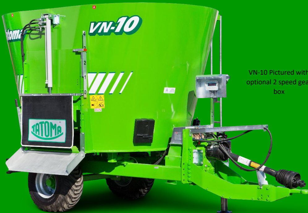
VN-10 Pictured with optional 2 speed gear box